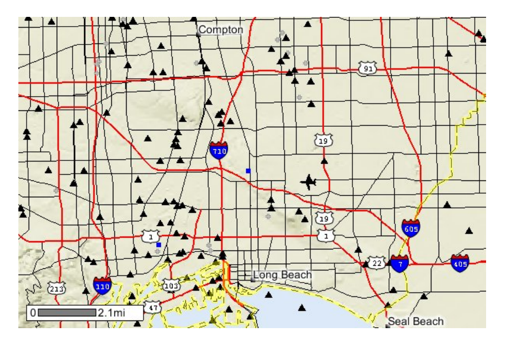
Figure 2-2 Example of a CHAPIS Map of Central Los Angeles Port Regions

Mapping Sources of Toxic Air Contaminants. Land use/zoning maps should be utilized to identify the location of facilities and transit corridors that are potential sources of TACs and the locations of sensitive receptors. An internet-based mapping tool is available from CARB that allows local planners to view maps showing the locations of The Community Health Air Pollution Information System air pollution sources. (CHAPIS) was developed by ARB and the State's 35 local air districts. The AQMD provides the data for facilities in its jurisdiction. Facilities that emit 10 or more tons per year of nitrogen oxides, sulfur oxides, carbon monoxide, PM<sub>10</sub>, or reactive organic gases are included in the database. AQMD facilities that emit TACs are being phased in by categories. The CHAPIS database includes chemical manufacturing, metal fabrication, and aerospace/electronics manufacturing facilities if they have conducted health risk assessments under California's Air Toxics "Hot Spots" program. The remaining "Hot Spot" facilities and other industries and smaller businesses, such as gas stations and dry cleaners will eventually be added. An example of a CHAPIS map for the Central Los Angeles - Port region is shown in Figure 2-2.